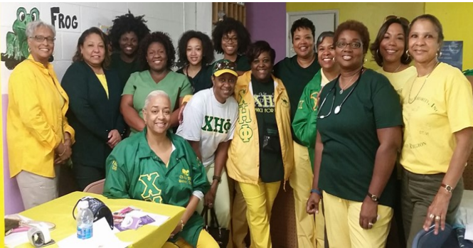
Sorors of Gamma Chi and the Fabulous Five

On Saturday, October 8, 2016, the Fabulous Five (Chi Club) partnered with Living Faith Worship Center for their first Annual “Early Detection Saves Lives” health event featuring Breast Cancer Awareness. The theme of the health fair was “More than Conquerors: We are Overcomers.”